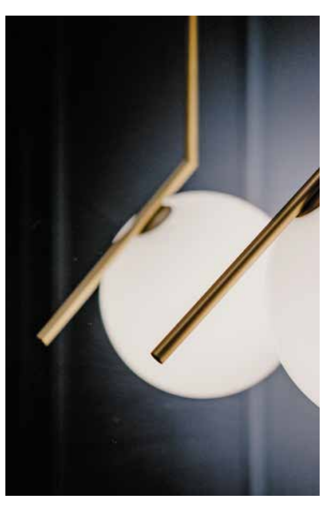
\frac{\textit{Meticulous detailing and hand-picked pieces enhance}}{\textit{the elegant aesthetic throughout the apartment}}.

The detailing is meticulous: bespoke cabinetry with inset lighting, leather covered cabinet doors with visible stitching, a wood panelled "waffle" ceiling in the living area, inset rope lighting in the corridor ceiling, curtain rails along the seafront windows that are set into the ceiling and hidden from view.